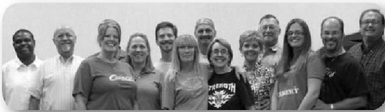
TMEW Ministry Team ~ Angelina County, Texas