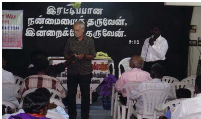
MADURAI, INDIA Leadership Training

Note: The man wearing a pink shirt stood before the group and said that all alcoholics should be put in jail to rot.