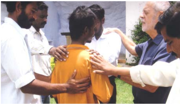
Pastors pray for an alcoholic.

Church in DHARMAPURI, INDIA, in the heart of Tamil Nadu state, built by the 35 members. Very serious alcohol problem in this area.